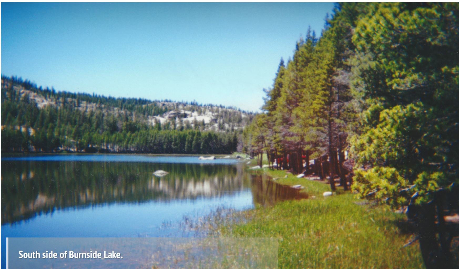
South side of Burnside Lake.