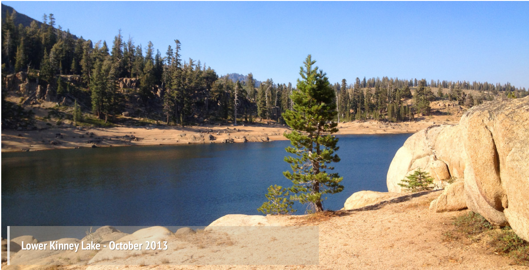
Lower Kinney Lake - October 2013