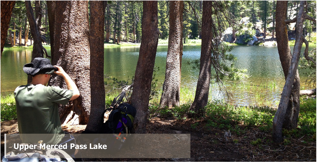
Upper Merced Pass Lake