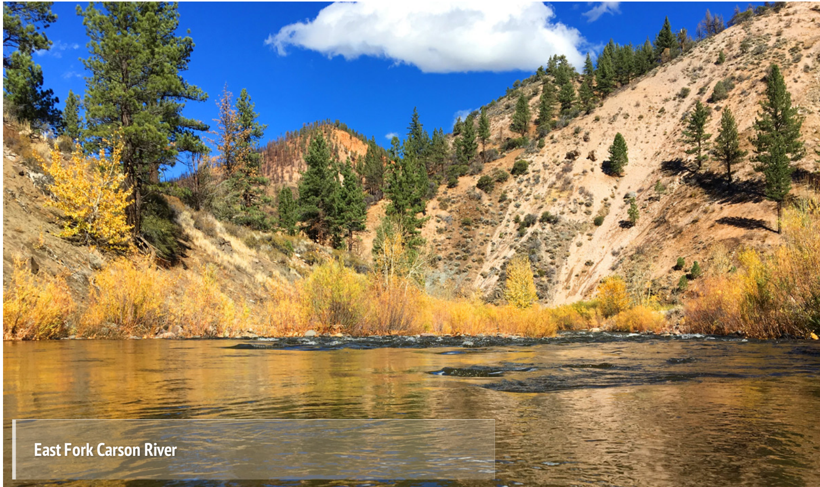
East Fork Carson River