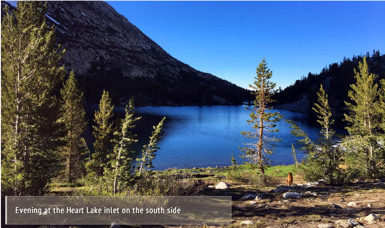
Evening at the Heart Lake inlet on the south side