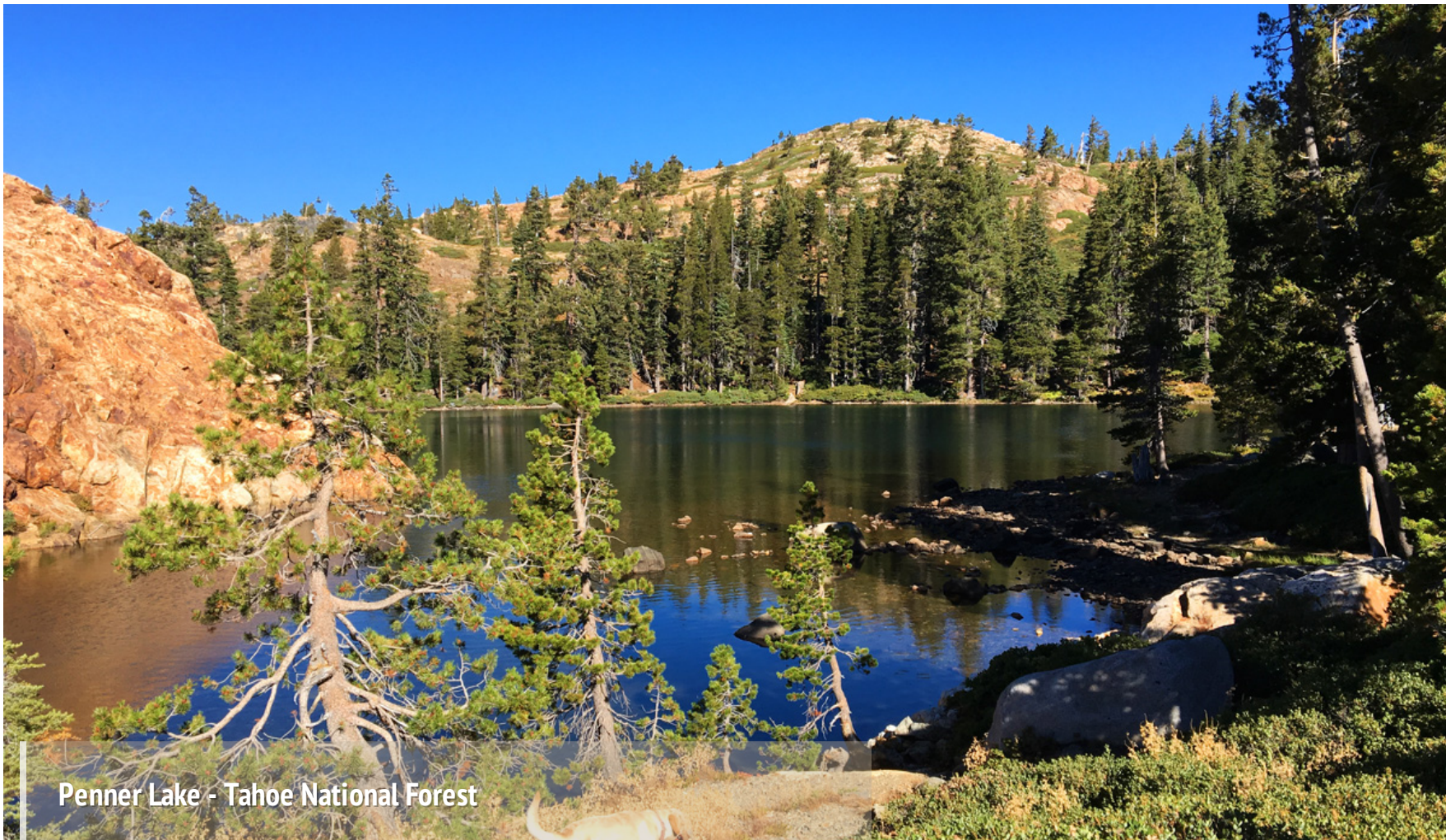
Penner Lake - Tahoe National Forest