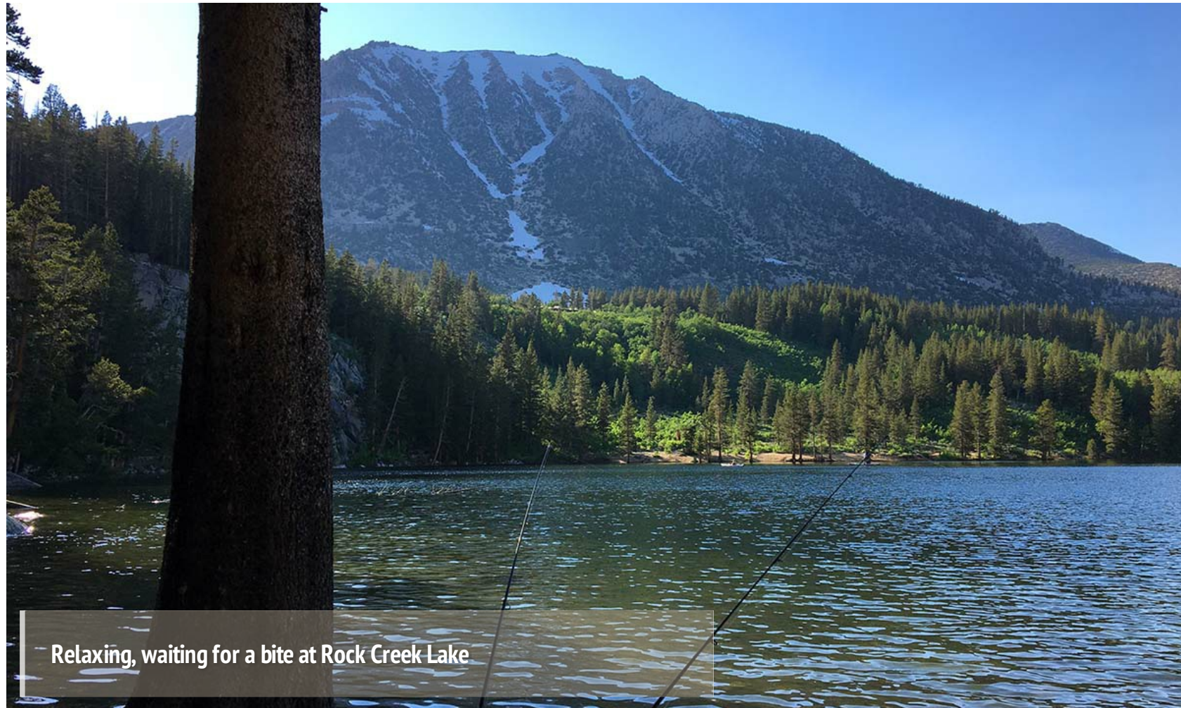
Relaxing, waiting for a bite at Rock Creek Lake