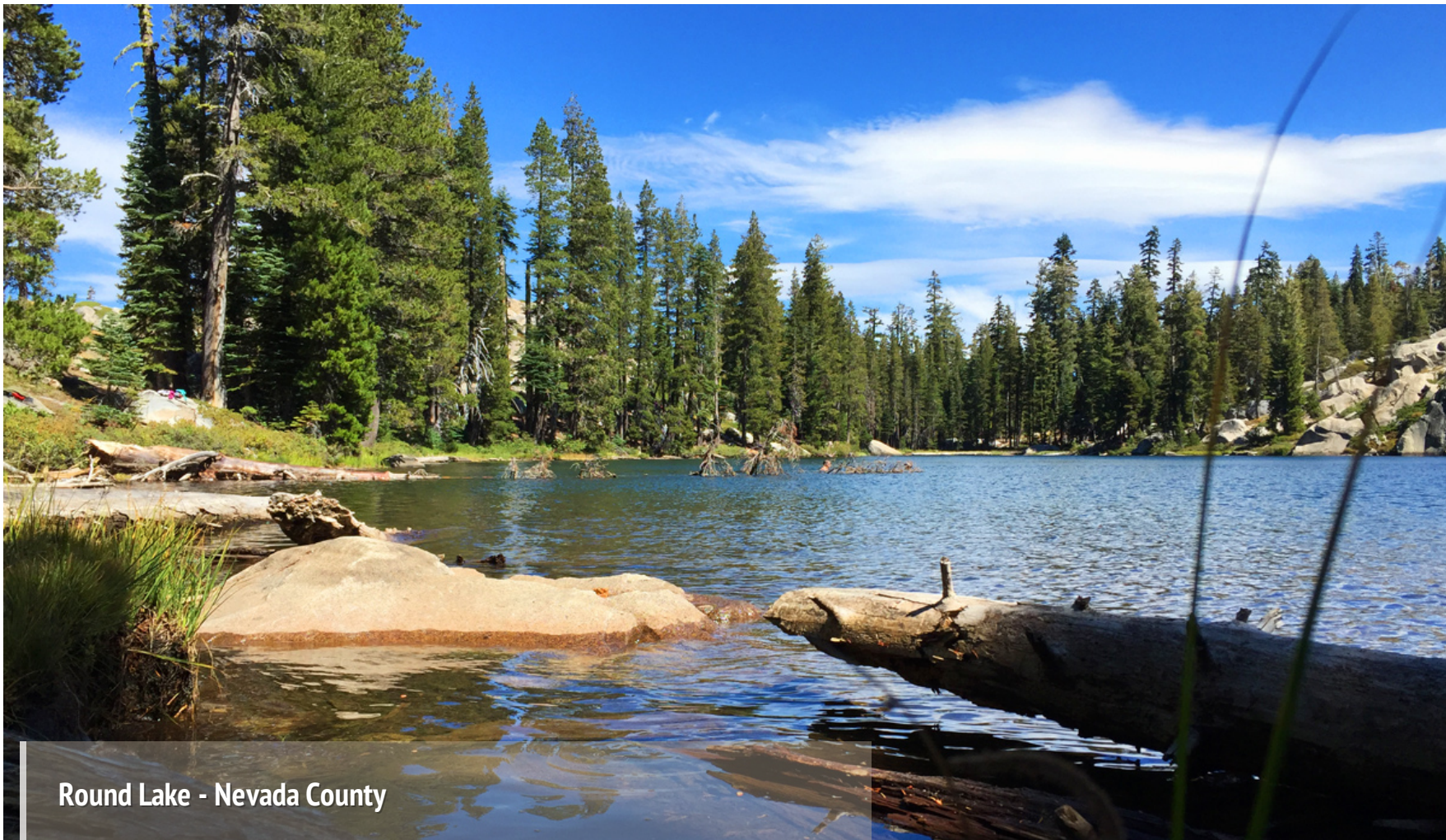
Round Lake - Nevada County